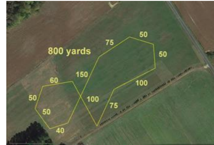
Sunday 760 yds